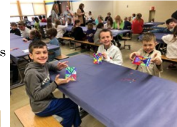
Our latest project: Lenten Stained-Glass canvas painting.