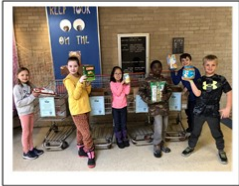
3 rd grade students donate to food shelf.

We are collecting food for the McCleod Food Shelf from March 13-31st as a service project. Cash donations are also accepted. You can bring your food and goods donations to the carts in the school foyer.