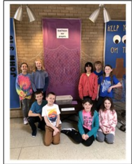
4th grade students at the prayer net.

If you come through the school feel free to add your own prayers to the prayer net and any food donations into the carts. Blessings to you during this season of Lent!