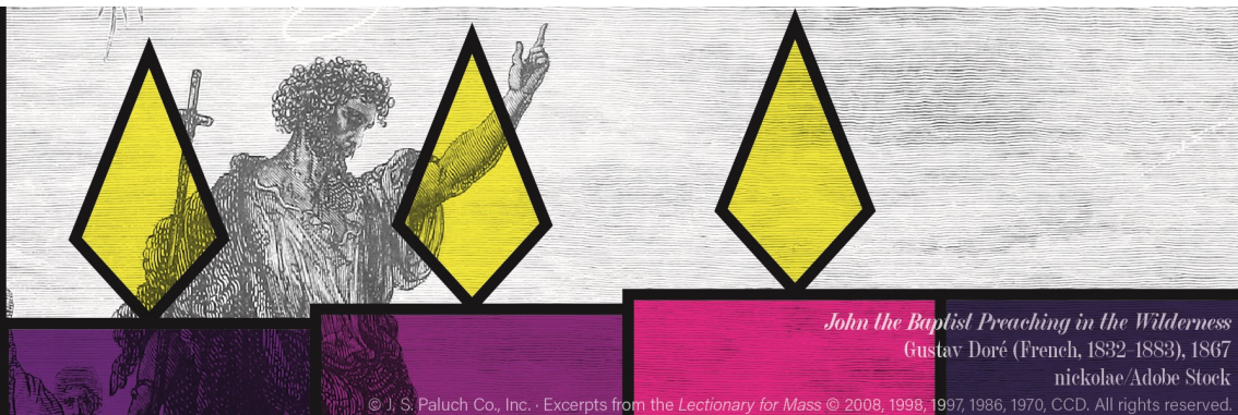
John the Baptist Preaching in the Wilderness