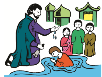
St. Francis Xavier

What righteous deeds would I be able to bring with me if Christ returned this week?