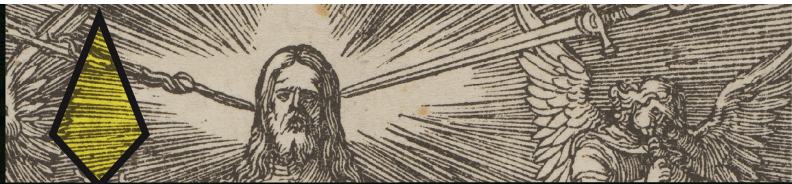
The Last Judgement, from The Small Passion Albrecht Dürer (German, 1471-1528), c. 1510 Metropolitan Museum of Art, New York

© J. S. Paluch Co., Inc. Excerpts from the Dictionary for Mass © 2000, 1998, 1997, 1986, 1970, CCD. All rights reserved.