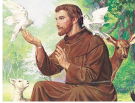
St Francis of Assisi Oct 4