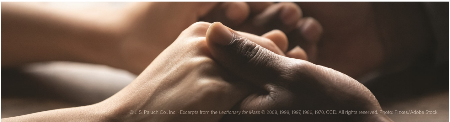
© J. S. Paluch Co., Inc. - Excerpts from the Lectionary for Mass © 2008, 1998, 1997, 1986, 1970, CCD. All rights reserved.

Jesus said, "Where two or three are gathered together in my name, there am I in the midst of them."