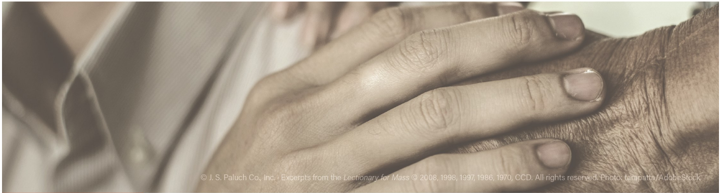
© J. S. Paluch Co., Inc. Excerpts from the Lectionary for Mass © 2008, 1998, 1997, 1986, 1970, CCD. All rights reserved.

Peter asked, "Lord, how often must I forgive? As many as seven times?"