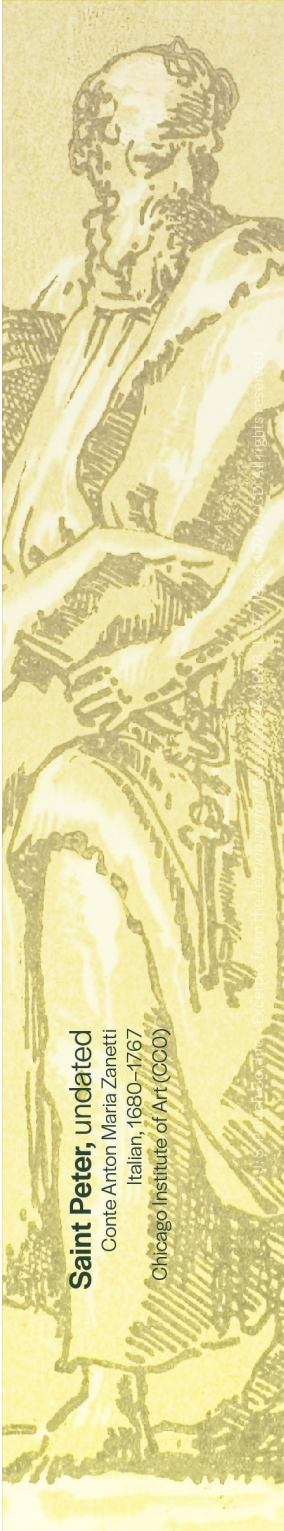
Saint Peter, undated Conte Anton Maria Zanetti Italian, 1680-1767 Chicago Institute of Art (CIC)