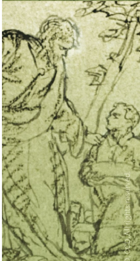
Miracle of the Loaves and Fishes, undated